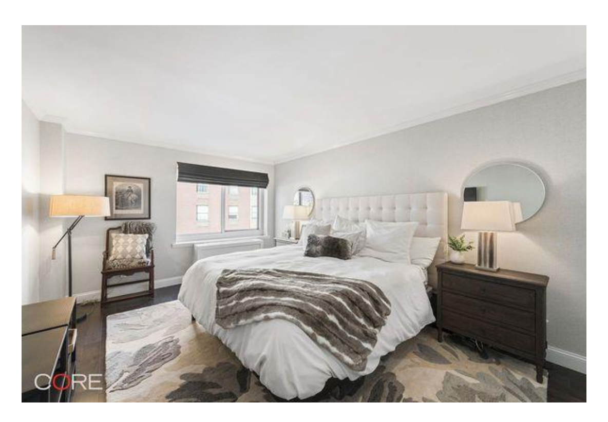
↑ This 932-square-foot condo on the Upper West Side is renting for an even $5,000/month. The space has been renovated and features oversized windows that let in lots of sunlight, an open living/dining room, a large windowed kitchen, one spacious bedroom, a full bathroom, and a washer/dryer. Perhaps the best feature is the 500-square-foot terrace.