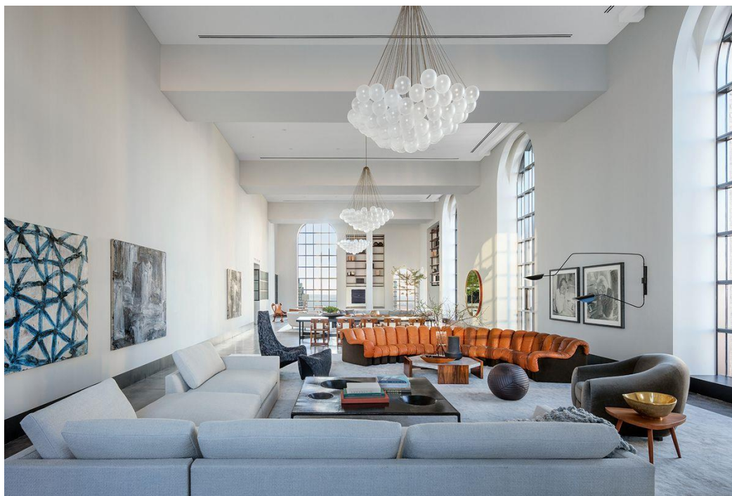
The living room in this penthouse is more than 3,000 square feet.

Once asking $59 million, the massive apartment has gotten a nearly $20 million discount