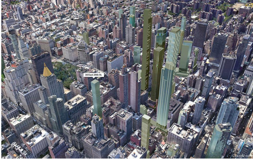
Google Earth aerial map of Rose Hill