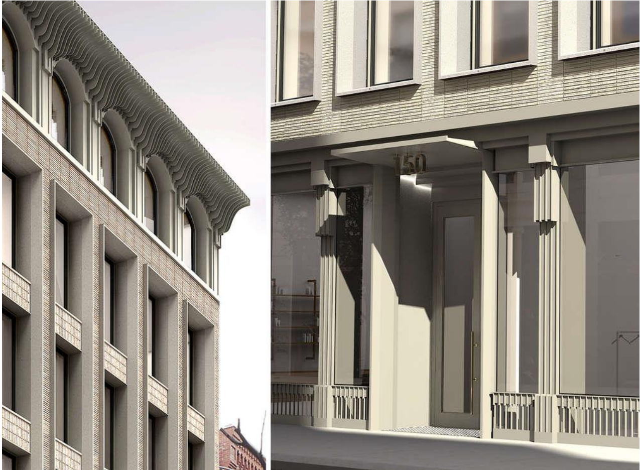
Renderings of 150 Wooster Street (KUB)

Two retail units and 6 full-floor spreads will be assembled inside the 30,000-square-foot building. Images have yet to be released of the condos but they are said to be “defined by a clean and chic sensibility.” The full-floor units will start at approximately $12,950,000 and the top unit will be a duplex penthouse. CORE’s Emily Beare is leading sales and marketing for the project and a registration website has just launched for the building.