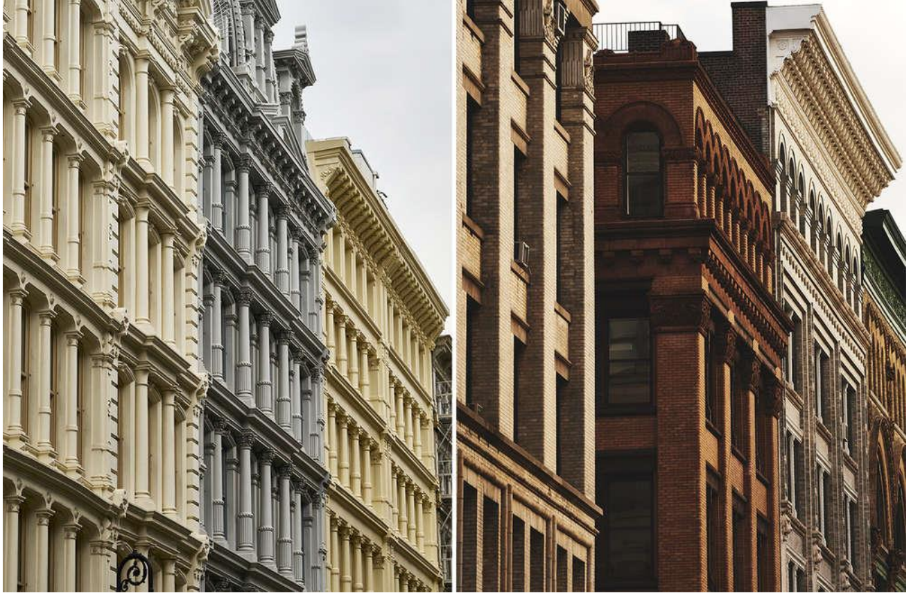
SoHo's spectacular urban fabric (KUB)

As with most developments navigating through the Landmarks Preservation Commission's approval process, the recently-unshrouded facade is top notch – displaying both style and charisma while upholding the architectural integrity of the surrounding district. The building is dressed in a masonry façade of elongated, handcrafted brick from Denmark and is highlighted by limestone piers and metal detailing. The top floor is distinguished from the rest by black metal cladding and its arched windows are crowned by a modern, undulating steel cornice. With facades like this, one must wonder how visually improved the city would be if all developers had to submit to a similar design committee.