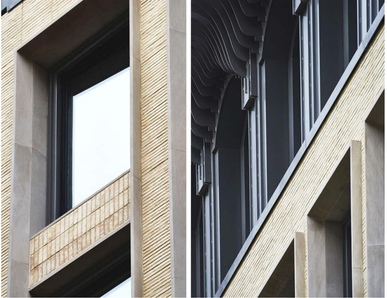
Close look at the beautiful brick and metal work of 150 Wooster (KUB)