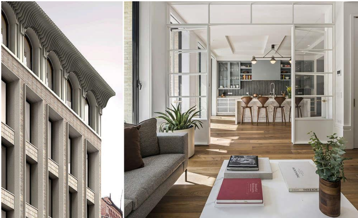
150 Wooster via KUB

When KUB conceived of 150 Wooster Street in the Soho Cast-Iron Historic District, it did so with an eye on Soho's history as well as its future. The design paid tribute to the neighborhood's industrial past. Indeed, this particular stretch is surrounded by the cast-iron fronts, Belgian block streets, and galleries that brought Soho to prominence in the past, not to mention the shopping that draws tourists and locals alike today.