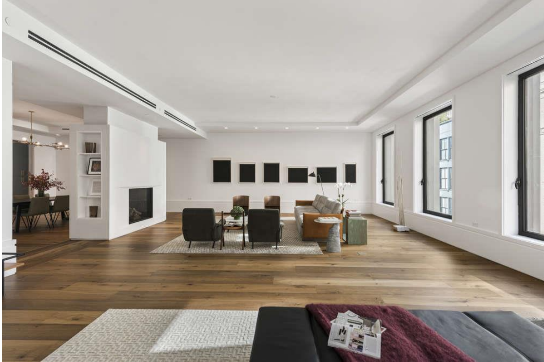
Living room via Core

Sales launched in October, and the building is nearly sold out. Loft Two, a full-floor, four-bedroom, four-bath, has just come on the market for $14.75 million. This price of $3,361 per square foot puts it at nearly 1.5 times the Soho average, and perhaps quite rightly. The open spaces and large-scale windows pay tribute to the artists' lofts of the 1960s and 1970s, yet the home is prewired for smart home automation and features an integrated Lutron lighting system, automated shades on the windows, and in-unit laundry room for all the modern conveniences a buyer could want. The expansive living and dining areas are separated by a sculptural gas fireplace.