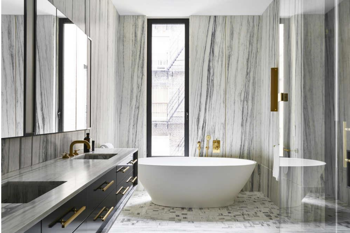
Bath via Core

The spa-like master bath features Danby marble custom vanity and mosaic floors and slab walls, a six-foot soaking tub, and separate water closet.