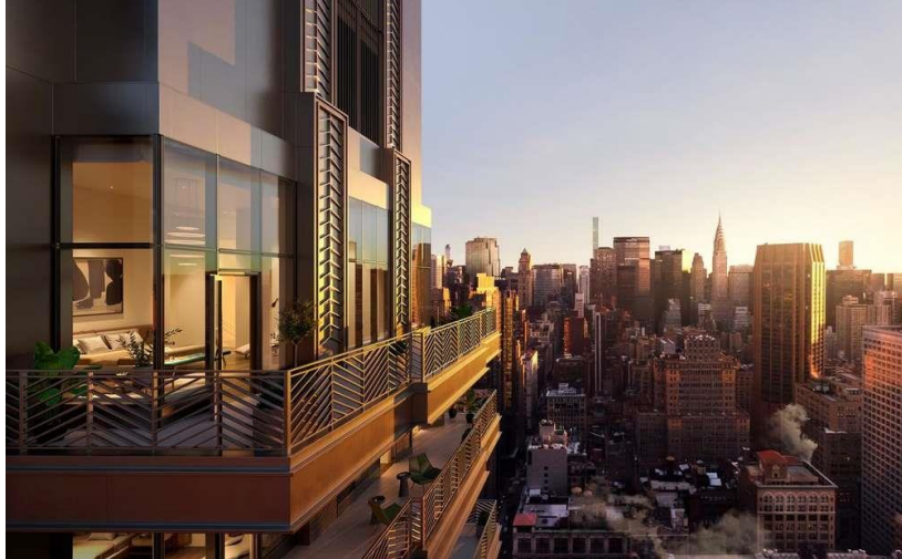
Penthouse levels will have outdoor areas overlooking NoMad, Madison Square Park, and the city (Rockefeller Group)

All 123 studio through four-bedroom condos boast soaring ceilings, hardwood floors, bronze fixtures, and cinematic views of New York City. Kitchens are outfitted with Miele appliances, custom Italian cabinetry, and marble counters. Master baths have custom vanities, aged brass fixtures, and heated floors. A series of “flex room homes” come accessorized with extra space behind sliding glass doors, which can be turned into a home office, nursery, home gym, dressing room, or whatever else the buyer can dream up. Penthouse residences feature marble fireplaces, large soaking tubs, and private terraces.