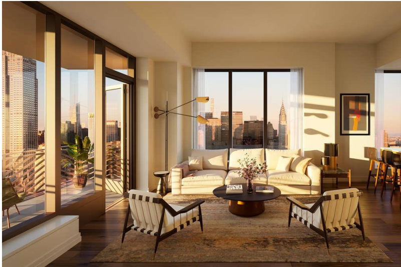
Living room