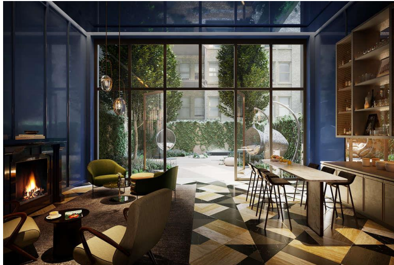
The exclusive lobby bar called The Blue Room (Rockefeller Group)

An exclusive lobby bar called the Blue Room has a lounge reminiscent of a luxury hotel's, marble fireplace with a bronze finished ornamental screen, a library curated by Strand Books, and a beautifully landscaped courtyard.