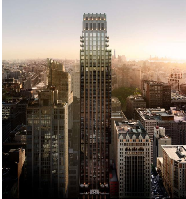
View of Rose Hill looking south over Madison Square Park and lower Manhattan