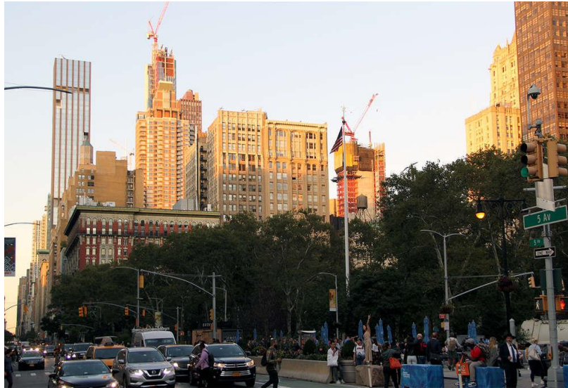
Rose Hill and Madison House condos seen under construction from Madison Square