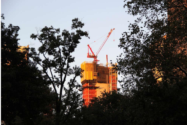
Rose Hill construction beginning to emerge above Madison Square Park