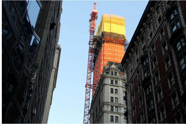
Rose Hill beginning to tower over its beautiful NoMad neighbors