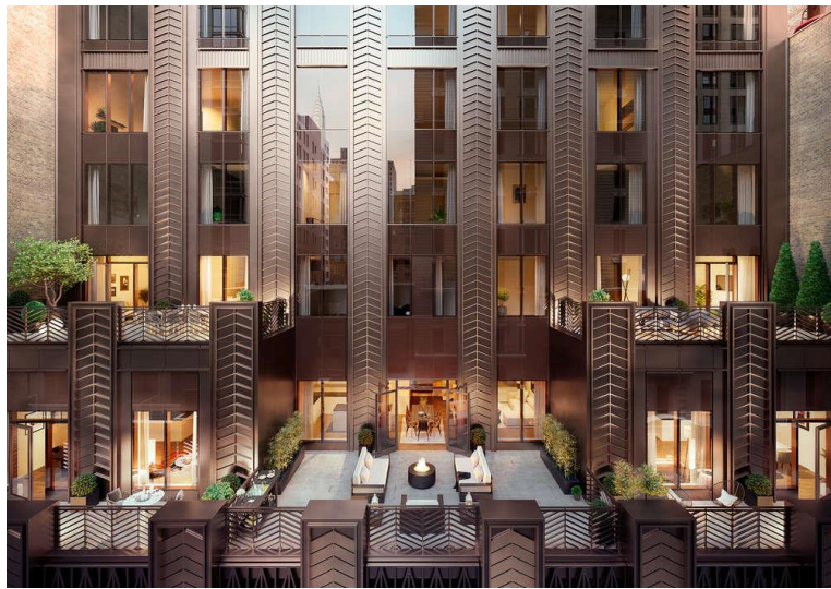
All renderings of Rose Hill via Pandiscio Green & Recent Spaces

The entire 37th floor is home to a private club with library, observatory, private dining room, guest suite, and various indoor and outdoor spaces.