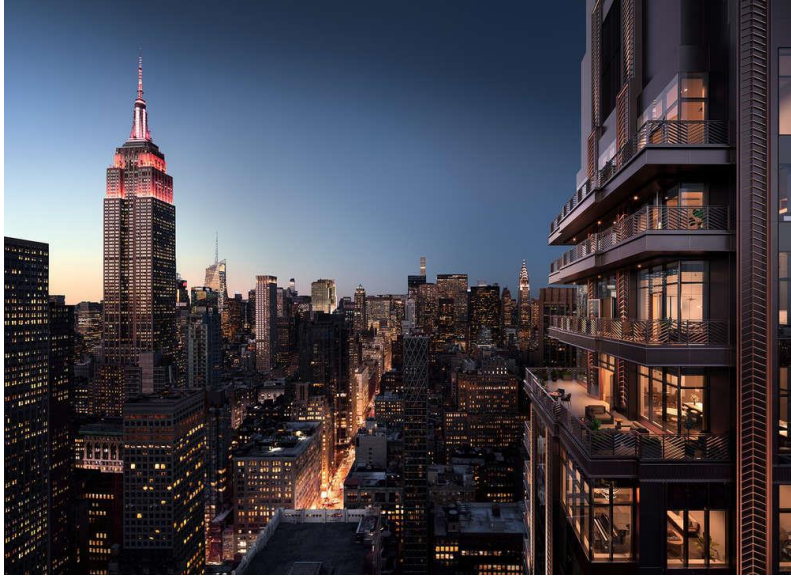
View of Rose Hill looking north towards the Empire State Building and Midtown