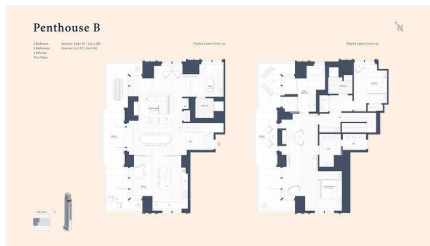
Penthouse B is a 2-bed, 3-bath asking $11,995,000

All 123 studio through four-bedroom condos boast soaring ceilings, hardwood floors, bronze fixtures, and cinematic views of New York City. Kitchens are outfitted with Miele appliances, custom Italian cabinetry, and marble counters. Master baths have custom vanities, aged brass fixtures, and heated floors. A series of “flex room homes” come accessorized with extra space behind sliding glass doors, which can be turned into a home office, nursery, home gym, dressing room, or whatever else the buyer can dream up. Penthouse residences feature marble fireplaces, large soaking tubs, and private terraces.