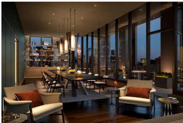
Private dining space to sit on the 37th floor