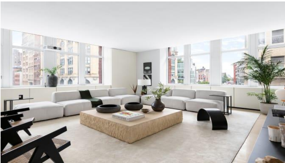
Tim Waltman/Evan Joseph Images for CORE