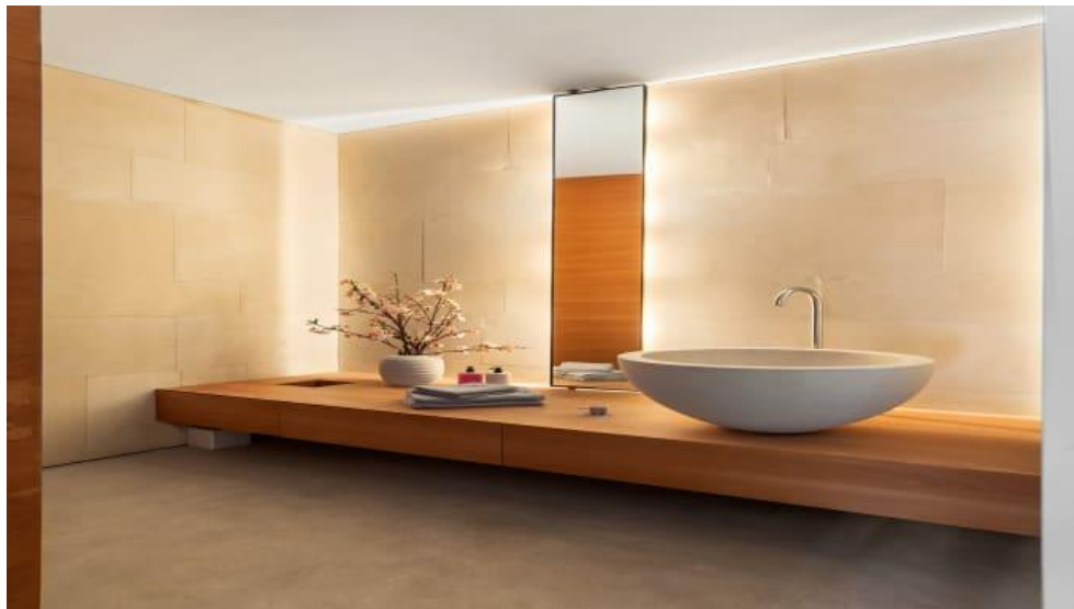
Tim Waltman/Evan Joseph Images for CORE