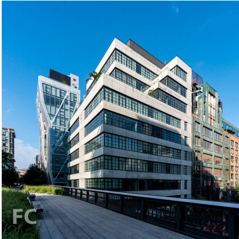
The ten-story, 14-unit Fitzroy is being developed by JDS Development Group and Largo Investments. Curbed New York gives Boston Valley Terra Cotta props: