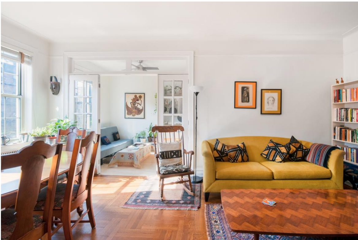
The apartment comes with an eat-in kitchen and a recently renovated bathroom. CORE

Apartment-wise, Jackson Heights, Queens is best known for its prewar co-ops, many of which share manicured courtyards. Condos are a bit tougher to find in the neighborhood. This two bedroom, one bath, listed by CORE for $780,000, is one of two condos currently on the market in the neighborhood. This one has a relatively low monthly common charge of $431 a month.