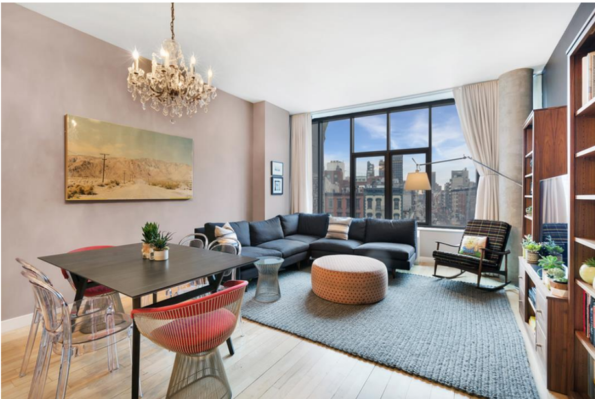
It's a floor-through apartment, and it looks like it gets plenty of natural light. CORE

This two-bedroom, two-bath condo is in a building immediately identifiable by its curved exterior (see photo at bottom). Designed by Richard Gluckman, who was also behind art museums including the Cooper Hewitt and the Philadelphia Museum of Art, the Soho building has the expected amenities for a luxury building of its size, and is close to several transit options. It's also around the corner from the famed French restaurant Balthazar.