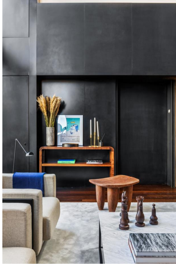
A key locked elevator provides private, direct access into the penthouse.