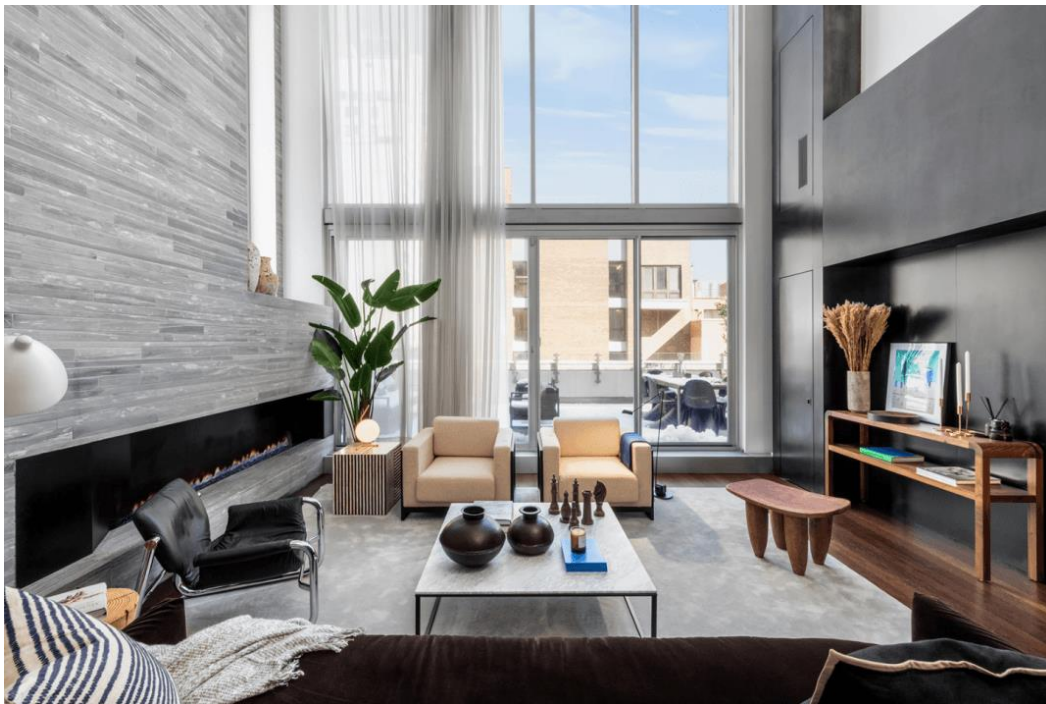
The living room has a two-story wall clad in Vals Quartzite—a type of gray stone quarried in Switzerland. CORE

The living room has a two-story wall clad in Vals Quartzite—a type of gray stone quarried in Switzerland.