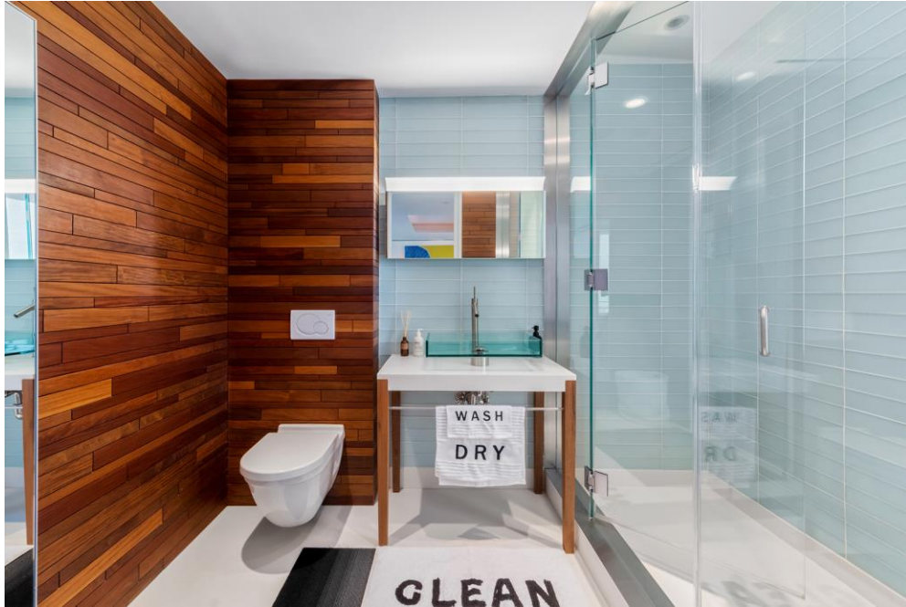
A guest bedroom has its own private terrace and a bathroom with teak planks and a Corian and glass tile walk-in shower and steam sauna.