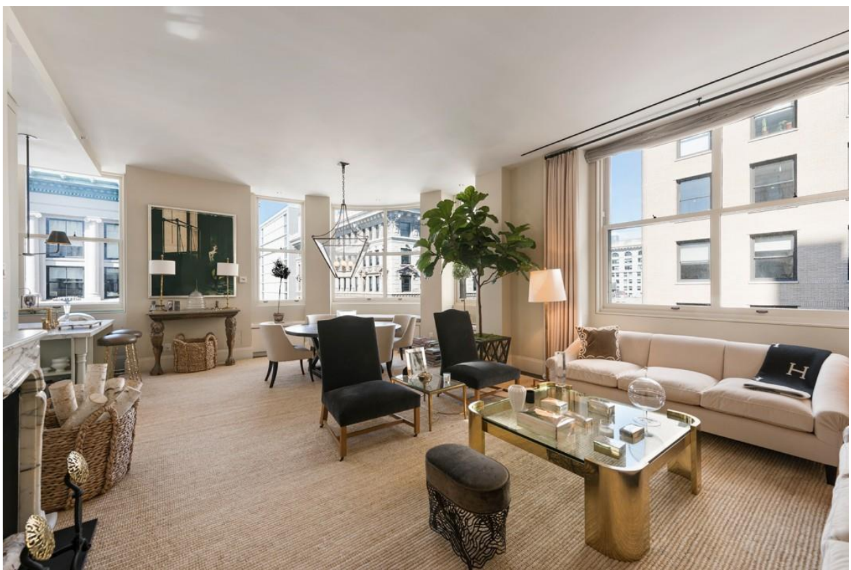
The curved living room offers expansive views of Fifth Avenue.

This two-bedroom, two-and-a-half-bath condo has a ritzy Flatiron address and plenty of prewar cred. The building was constructed in 1900 and converted to condos in 2007. Its history is evident in the generous square footage, high ceilings, and marble mantel, and the building's grand exterior is nothing to sneeze at, either.