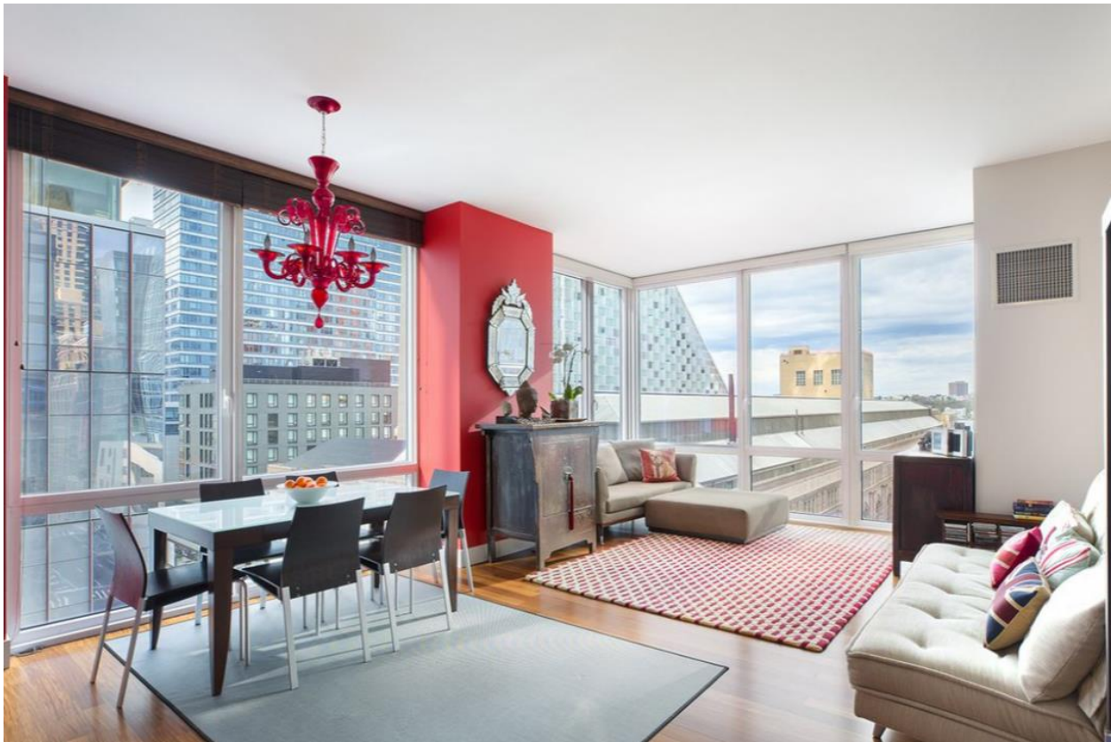
The apartment has impressive views. CORE

Four bedrooms are few and far between in New York City, but this condo, the result of a recent apartment combination, could feasibly sleep four (one of the bedrooms is on the small side.) There are also three bathrooms and a den.