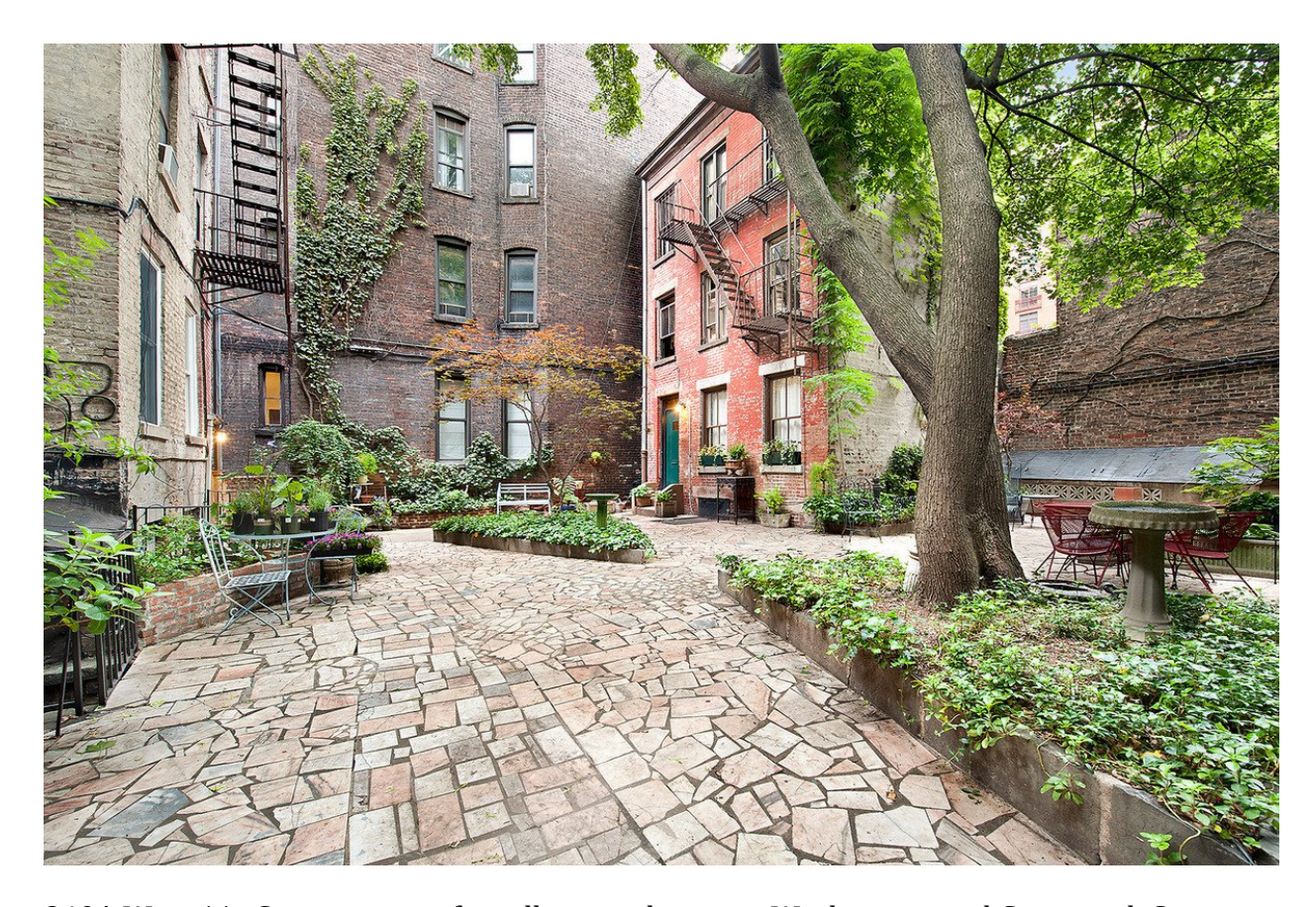
340A West 11<sup>th</sup> Street is a pet-friendly co-op between Washington and Greenwich Streets, hidden behind a cast iron gate. The peaceful home is just a short walk from all the West Village action, including the Hudson River Park, the High Line, and famous restaurants.