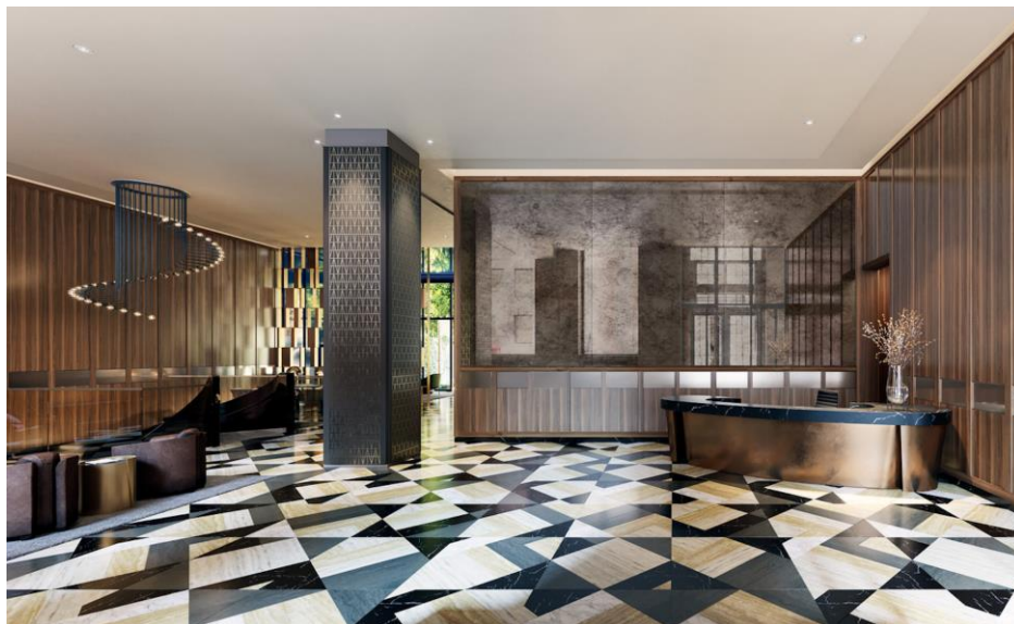
The double-height lobby features a black marble fireplace and hand-crafted metalwork

Notably, Rose Hill includes flex room layouts that allow residents to customize the space and alter them as needed. Designed with sliding glass doors, rooms can easily be converted into more fluid spaces.