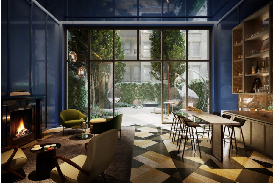
The Blue Room