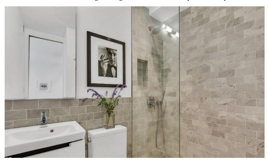
The bathroom was renovated with marble tiles, while the kitchen got new stainless steel appliances.