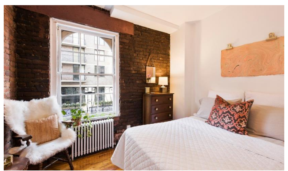
Two big closets (including one walk-in) keep clutter at bay.