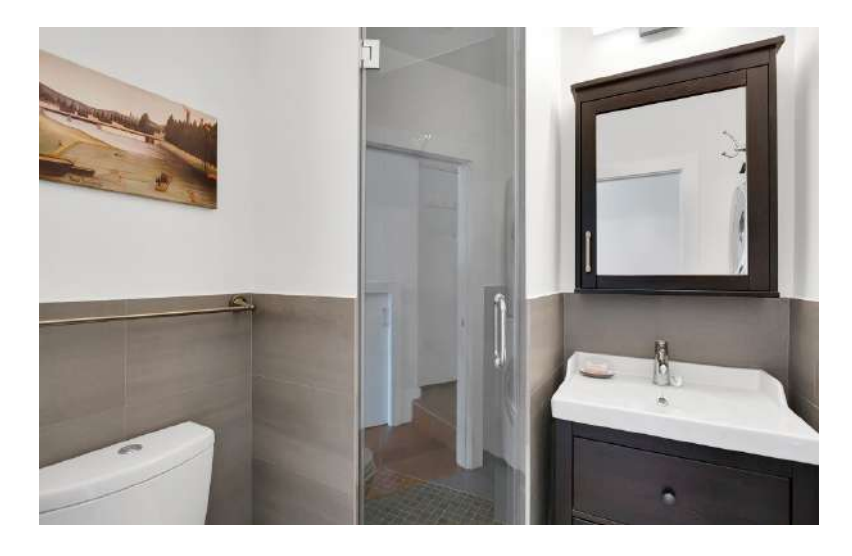
Just inside, an equally sunny bedroom gets a big walk-in closet and one of two newly-minted baths with radiant heat floors and all the trimmings.