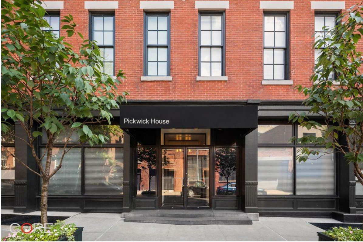
The six-story building has an elevator and counts Philip Seymour Hoffman among its resident alumni. It's just a seven-minute walk to the 14th Street A, C and E station.