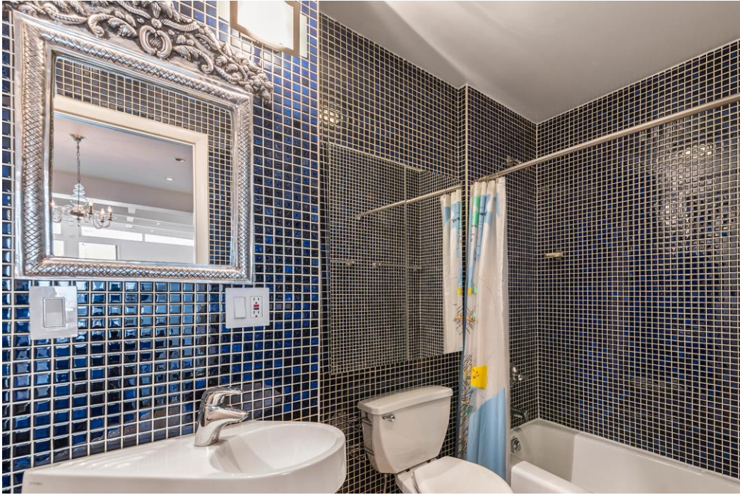
On the lower level a recreation room/media room could also be a fourth bedroom; there's a renovated full bath down here as well.