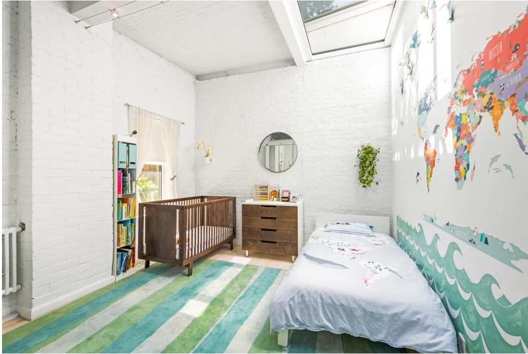
White painted brick and pale oak floors gleam beneath a 300-square-foot skylight on the main floor.