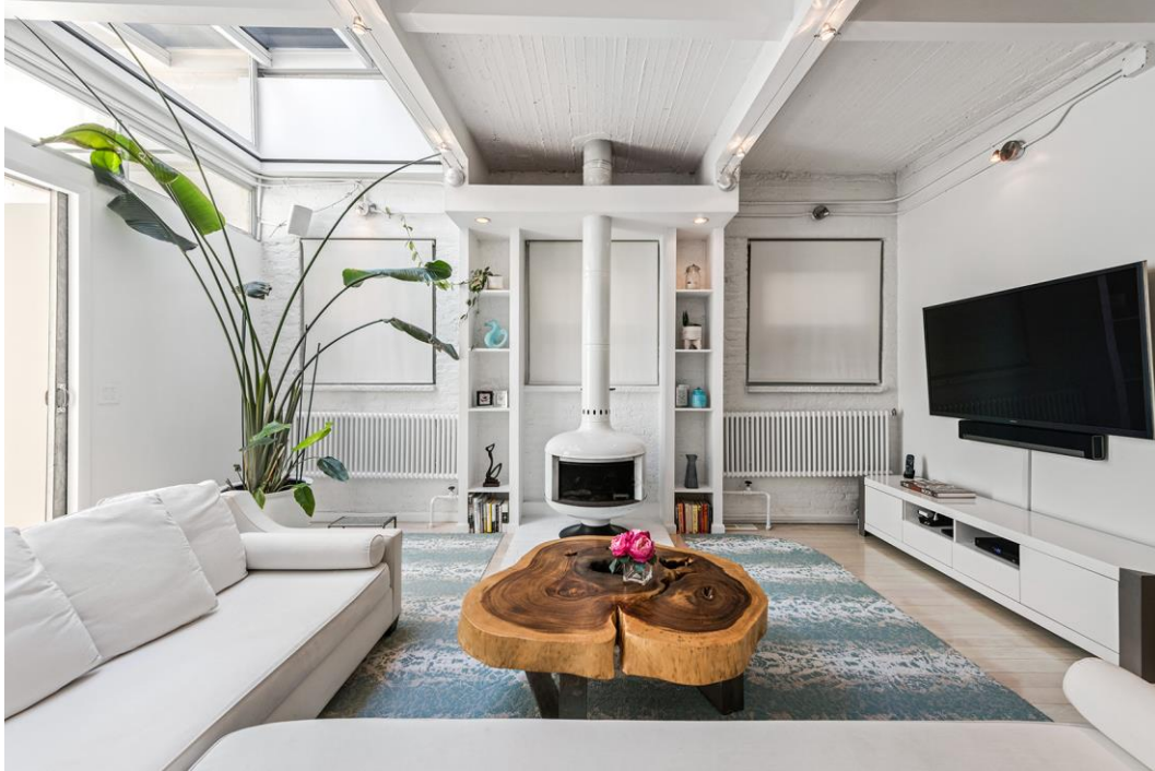
On the main level, a large open-plan living and dining area features a gas fireplace and built-in speaker system. Also on this floor are two bedrooms, a full bath and a washer/dryer.