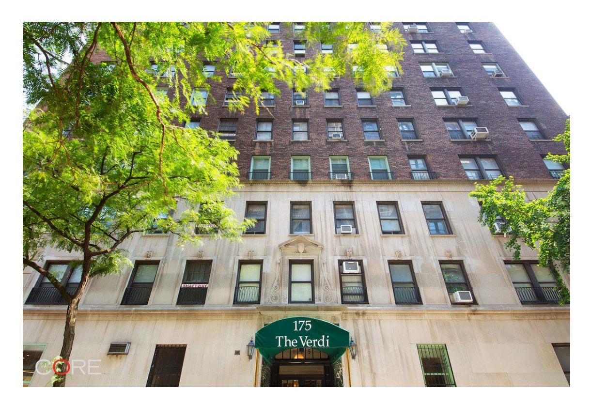
At just $605,000, the unit's sweet location if diminutive size makes it a relative deal, although the monthly maintenance fee of $1,055 is not cheap.