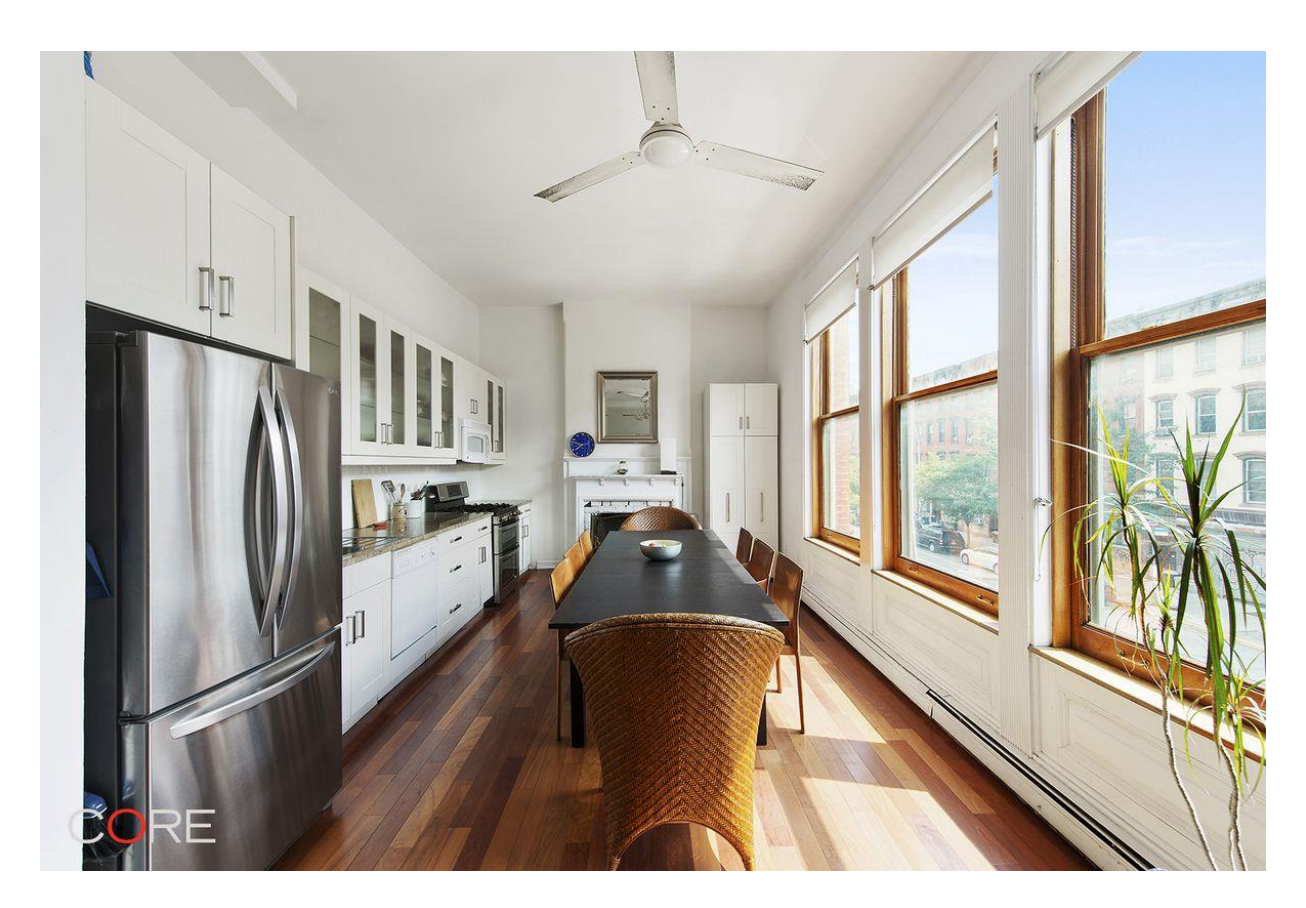
The second floor apartment offers three-bedrooms, 1.5 baths and 11-foot ceilings.