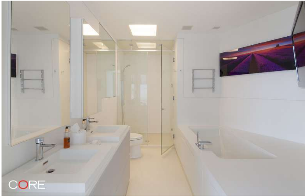
The three bedrooms have en-suite bathrooms.