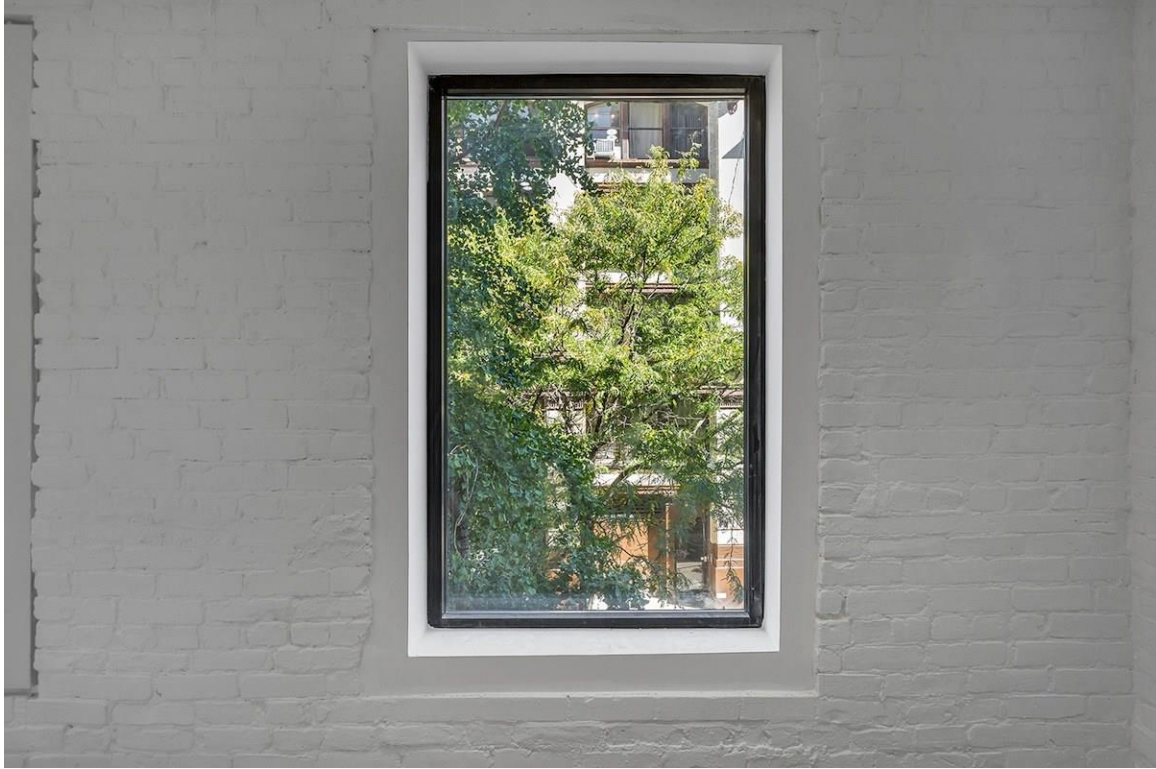
Each floor boasts seven large windows.