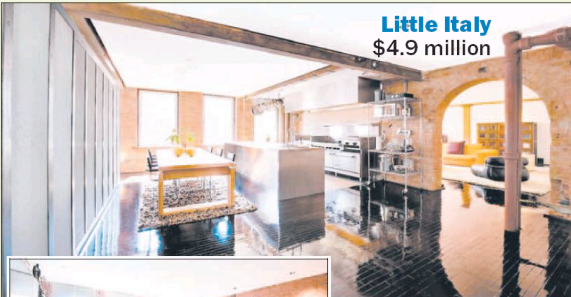
Little Italy $4.9 million